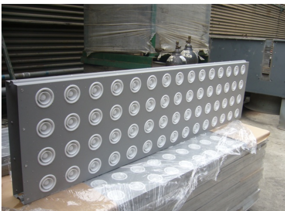
Standard Sound Absorption Panel