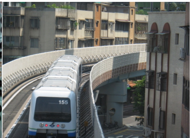
Train Station Track