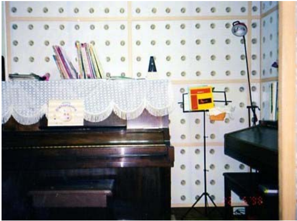
Internal Room Wall